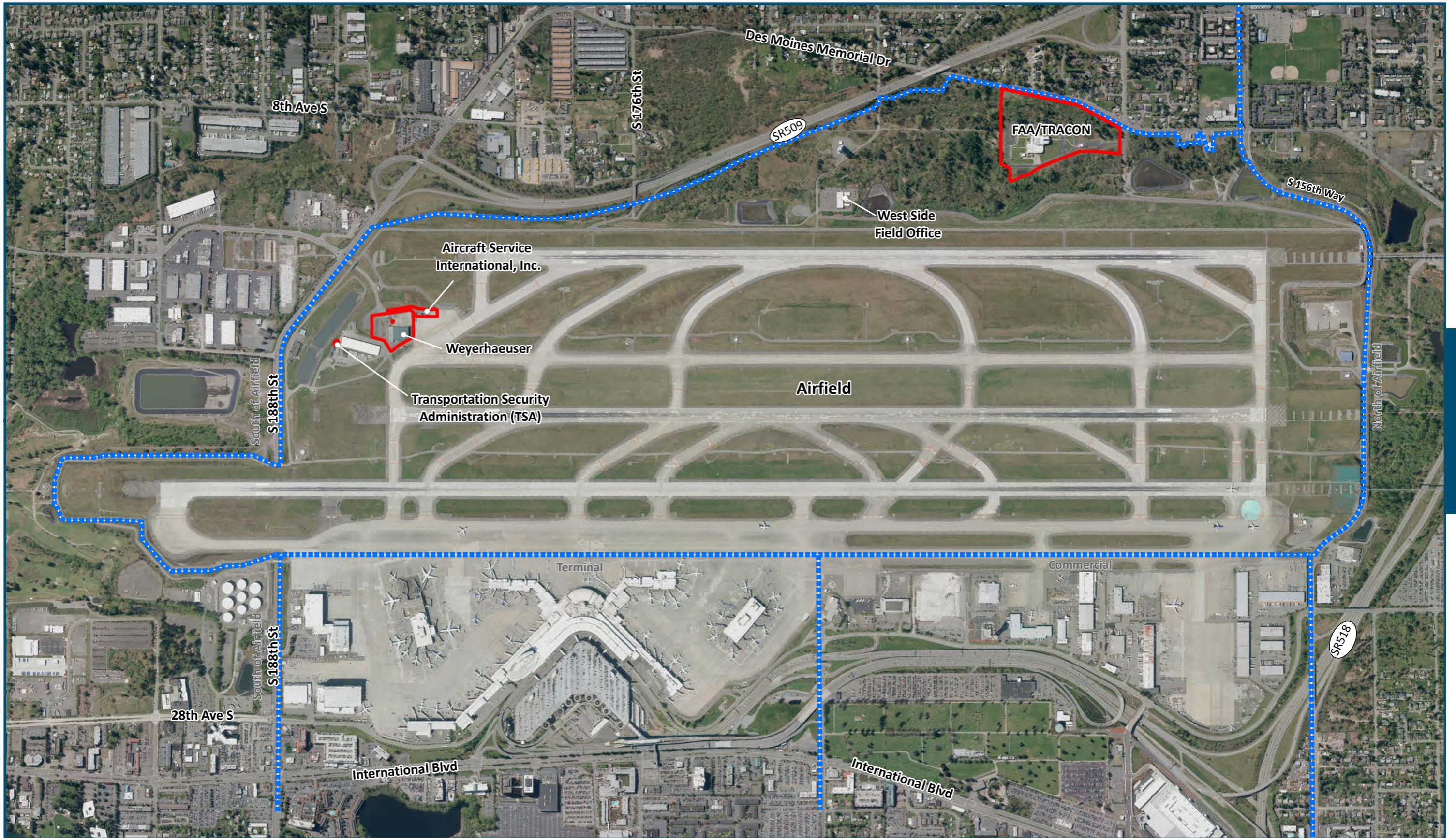
Aerial Photo Taken Spring 2012